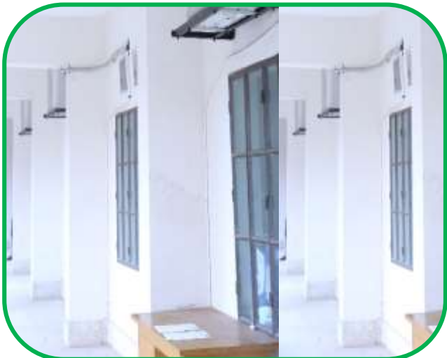
CEDP Funded Air-Conditioning Equipment in the Laboratory