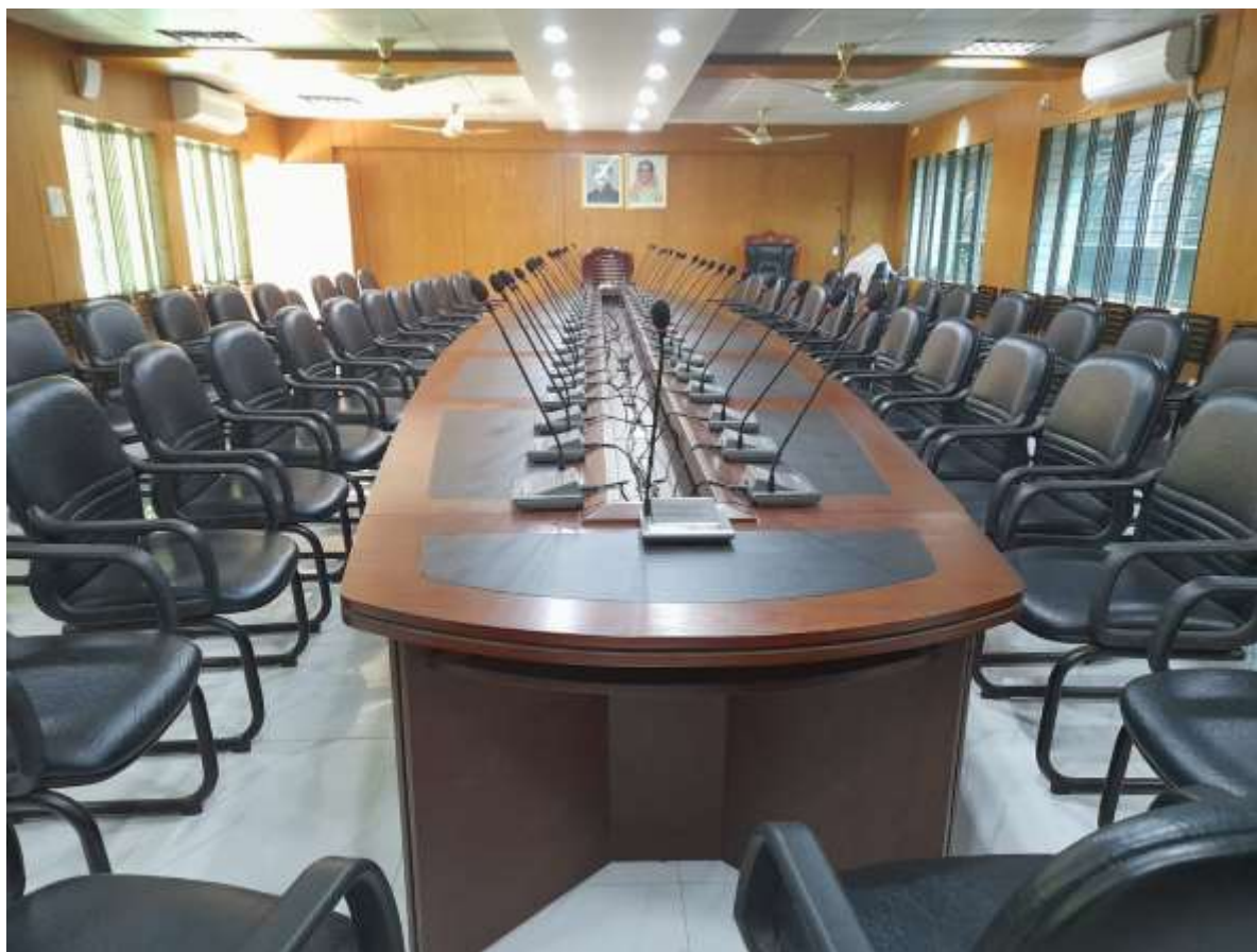
Teachers Common Room