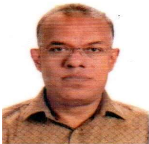
Principal of the college