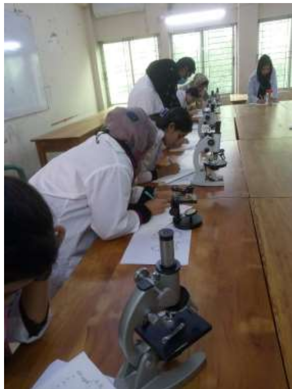
Students working on CEDP funded Laboratory