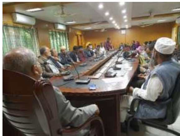
Teachers Common Room with Teachers in meeting