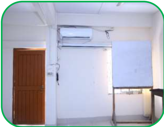
CEDP Funded Air-Conditioning Equipment in the Laboratory