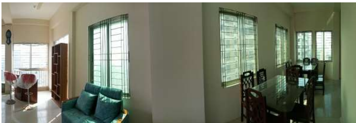
CEDP funded Tourism Laboratory