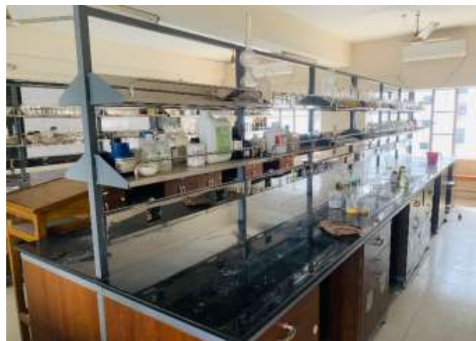
CEDP funded Chemistry Laboratory