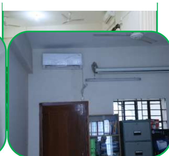
CEDP Funded Air-Conditioning Equipment in the Laboratory