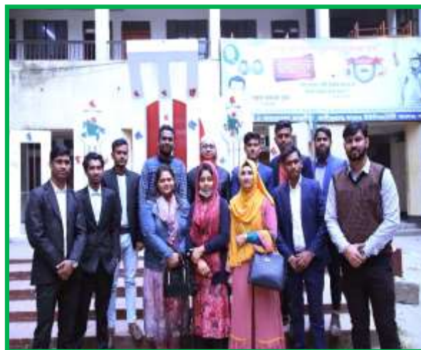
Shaheed Minar of the college