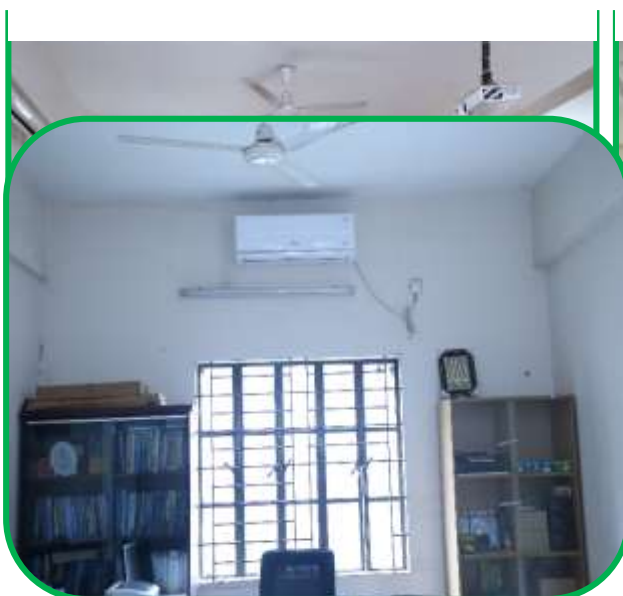
CEDP Funded Air-Conditioning Equipment in the Laboratory