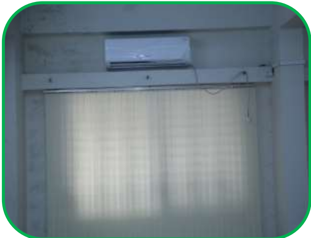
CEDP Funded Air-Conditioning Equipment in the Laboratory