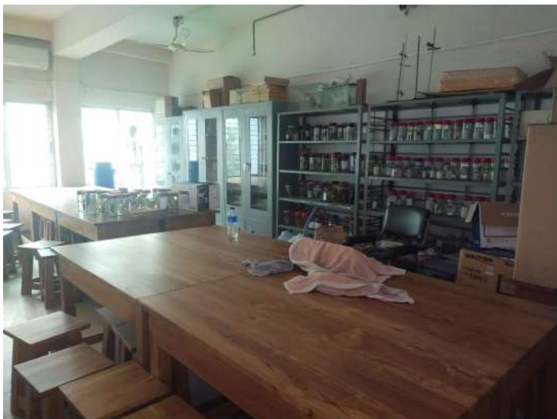
CEDP funded Laboratory