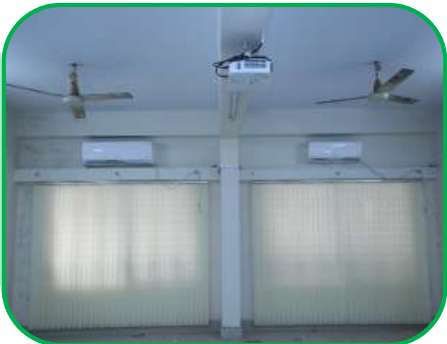
CEDP Funded Air-Conditioning Equipment in the Laboratory