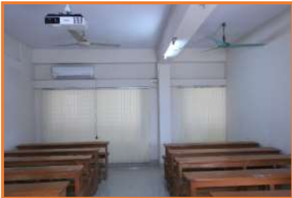
Air-conditioned Class Room