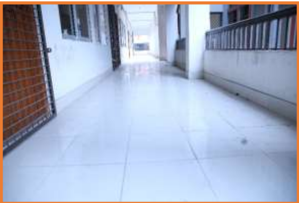
CEDP Funded Tiles Work